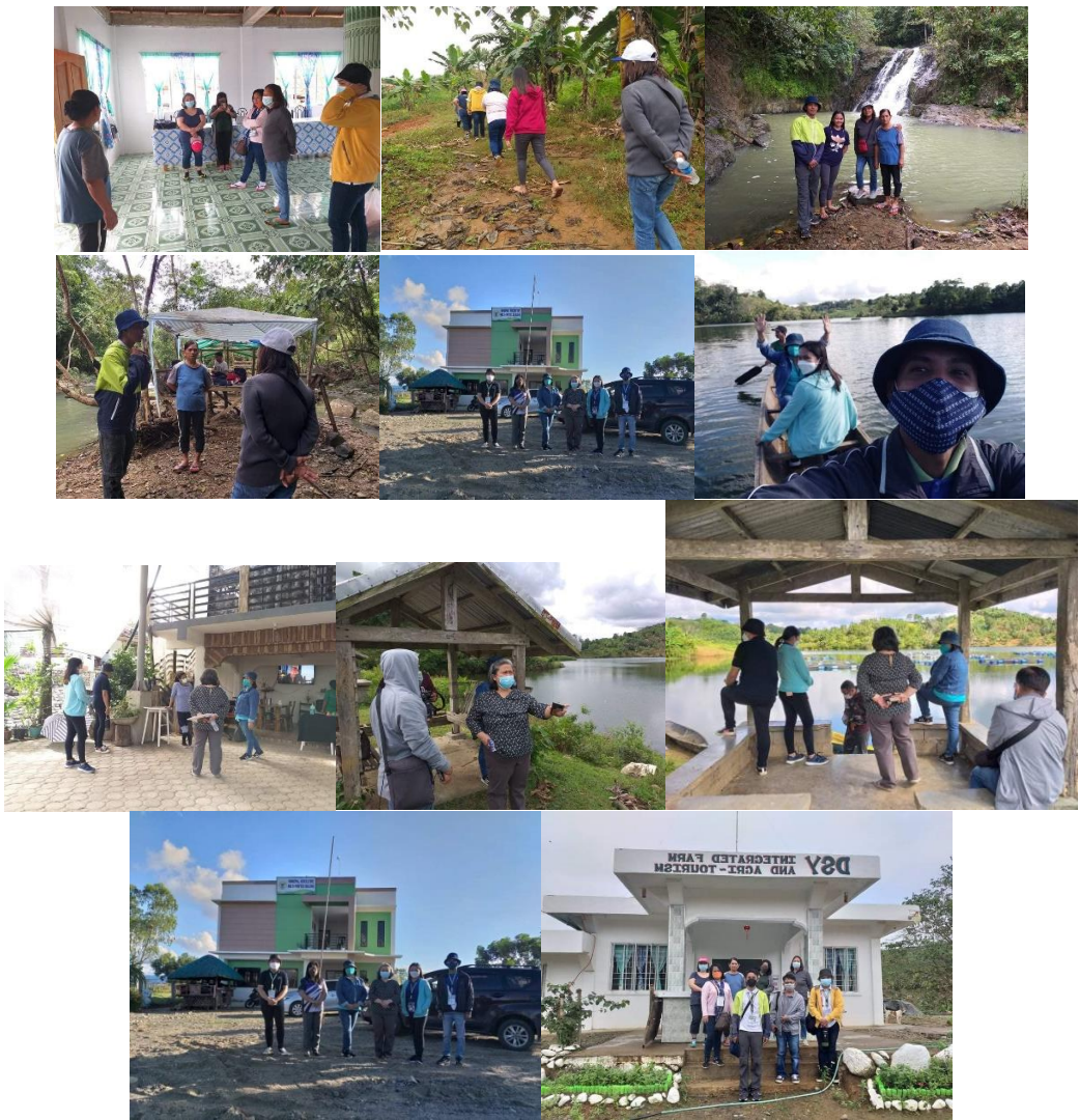
THE PROVINCIAL GOVERNMENT OF ISABELA - ISABELA TOURISM OFFICE CONDUCTED OCCULARS & TRY - OUT AND ASSESSMENT OF THE EXISTING, POTENTIAL AND EMERGING TOURISM DESTINATIONS AND TOURISM RELATED STABLISHMENTS FOR TECHNICAL ASSISTANCE NEEDED FOR THE MUNICIPALITY OF SAN MARIANO, ISABELA: CROCODILE REARING STATION, SAN MARIANO SWIP, AMISAN FALLS, ANGEL SOPHIE HOTEL, MARINELAS EVENT CENTER, INN AND SPA AND SAN MARIANO MUNICPAL AGRICULTURE FARM, SAN MARIANO, ISABELA. (01-13 to 14-22)