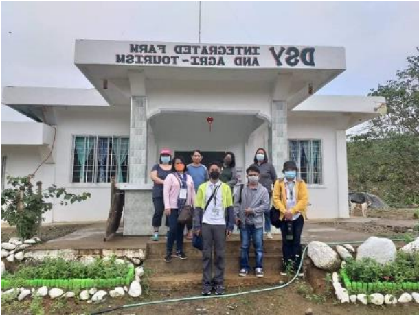
THE PROVINCIAL GOVERNMENT OF ISABELA - ISABELA TOURISM OFFICE CONDUCTED OCCULARS & TRY - OUT AND ASSESSMENT OF THE EXISTING, POTENTIAL AND EMERGING TOURISM DESTINATION AND TOURISM RELATED STABLISHMENTS FOR TECHNICAL ASSISTANCE NEEDED FOR THE MUNICIPALITY OF SAN MARIANO, ISABELA: CROCODILE REARING STATION, SAN MARIANO SWIP, AMISAN FALLS, ANGEL SOPHIE HOTEL, MARINELAS EVENT CENTER, INN AND SPA AND SAN MARIANO MUNICPAL AGRICULTURE FARM, SAN MARIANO, ISABELA. (01-13 to 14-22)