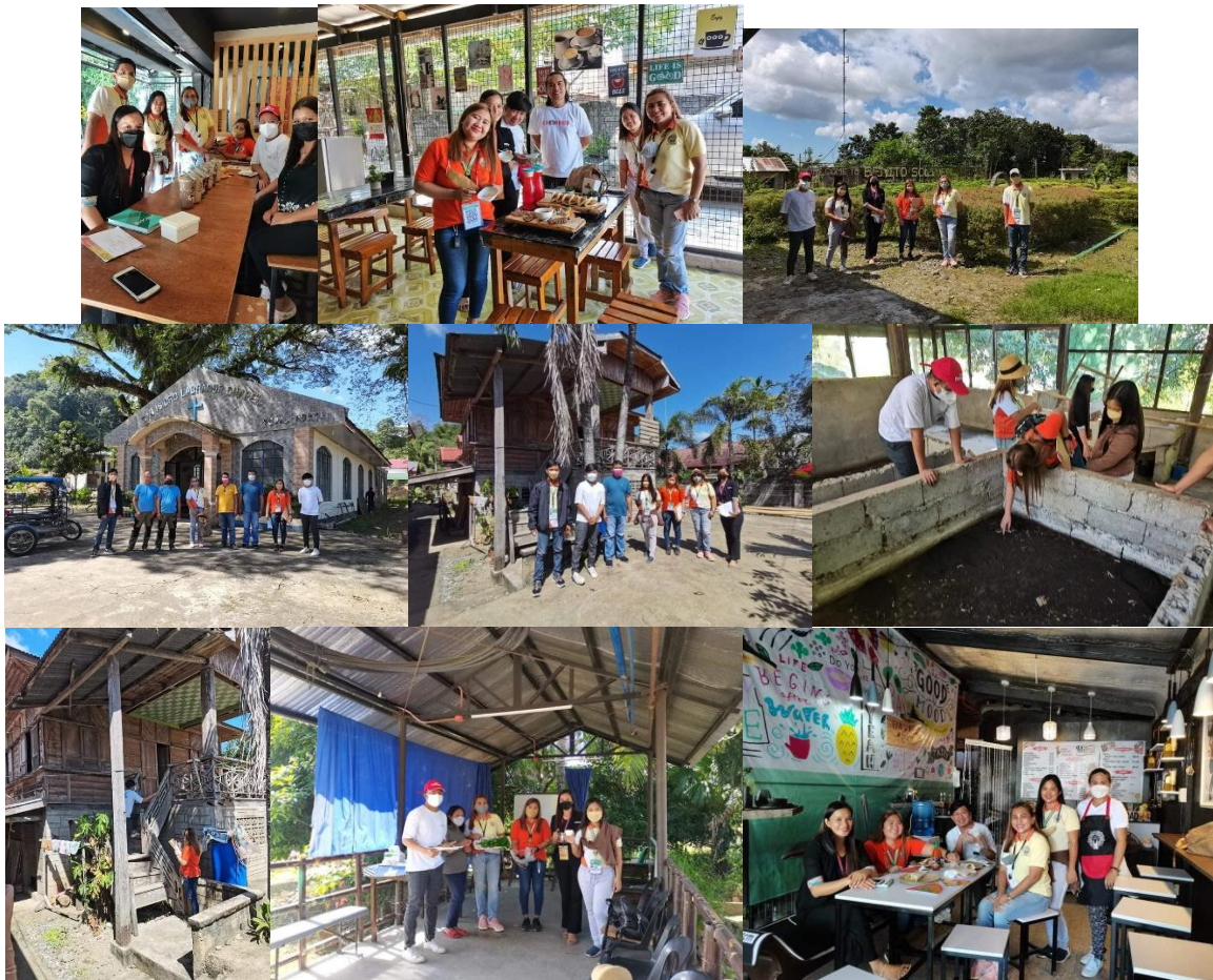
THE PROVINCIAL GOVERNMENT OF ISABELA - ISABELA TOURISM OFFICE CONDUCTED OCCULARS & TRY - OUT AND ASSESSMENT OF THE EXISTING, POTENTIAL AND EMERGING TOURISM DESTINATION AND TOURISM RELATED STABLISHMENTS FOR TECHNICAL ASSISTANCE NEEDED FOR THE MUNICIPALITY OF BENITO SOLIVEN, ISABELA: SWEET N TEAS CAFÉ, LA KUSINA RESTAURANT, SAN ISIDRO LABRADOR CHAPEL OLD BELLS AND CENTURY TREE, BENITO SOLIVEN VIEW DECK, SWIP DAM-AMIA VILLAGE, UNO ECO FARM, ANCESTRAL HOUSES, AND MOM JENS RESTAURANT, BENITO SOLIVEN, ISABELA. (02-09-22)