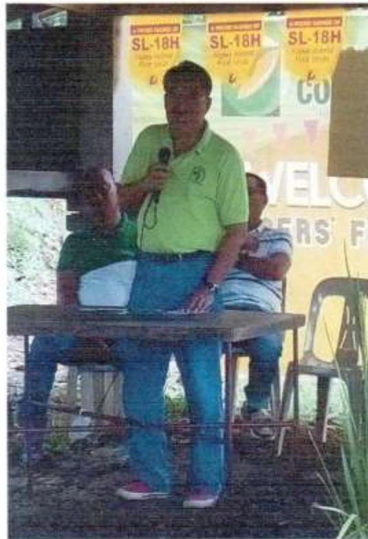
During the PLGU-MLGU Doble Ani Program Field Day in Mabini, Gamu, Isabela. It was attended and participated by 150 farmers. Graced by the Prov'l. Agriculturist, CVRC Center Chief counterparts from SL-Agritech.