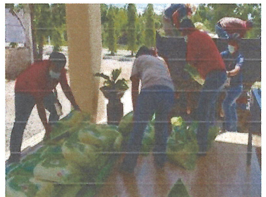
Rice Distribution for the PGI Employees