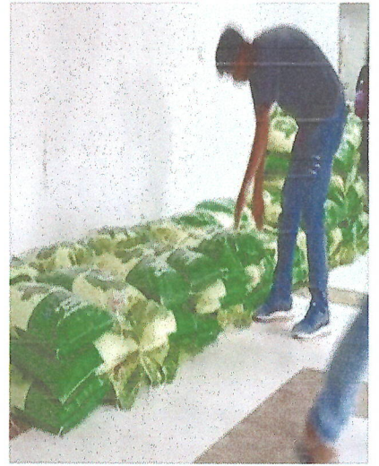
NMIAC rice ready for the distribution for the TUPAD recipients