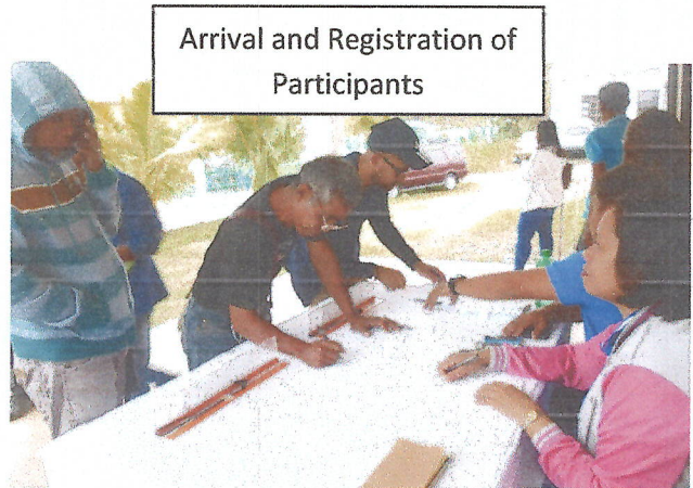
Arrival and Registration of Participants