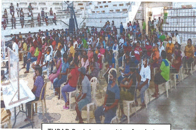
TUPAD Recipients waiting for their validation