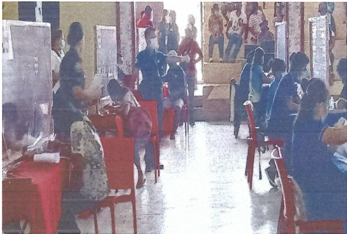
PCDO Staff assisted in the validation of TUPAD recipients