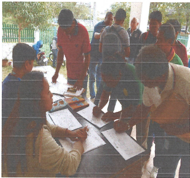
Arrival and Registration of participants