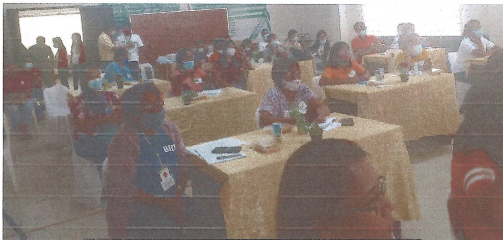
Participants are actively listening on the lecture.