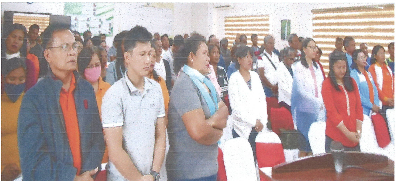
The 221 participants came from Micro and Small Cooperatives in Isabela