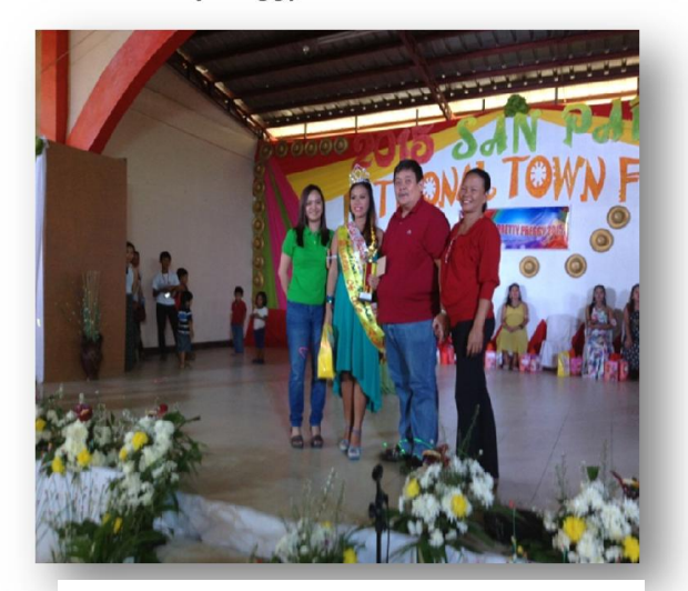
The winner of this pageant is from 2 Barangay Awitan, San Pablo, Isabela

A pregnant woman from Barangay Awitan won this year's search for pretty preggy. She received 5,000 Php cash, trophy, gift packages from the sponsors and she will be given free delivery services at the birthing centers.