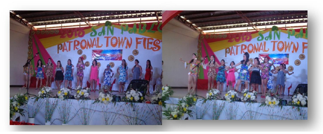
Meet the 12 candidates of "San Pablo Pretty Preggy 2015"

pose and personality 15%, Beauty 35%, Intelligence 40% and Stage Presence 10%. All candidates showcased their talents through singing, dancing and poster making.