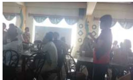
One of the PHO team of doctors clarifies her concerns in filling-up the LIPH templates