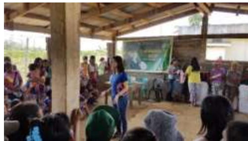
The Municipal Health Officer of San Mariano delivers her message and encouragement to continue the fight against Malaria to the members of the community of Brgy. Dibuluan