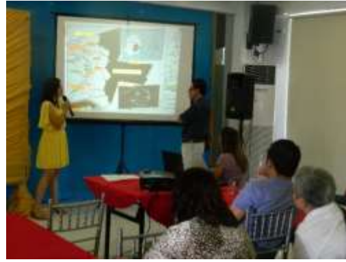
Discussion of strategies for maintaining zero malaria status for the municipality of San Mariano