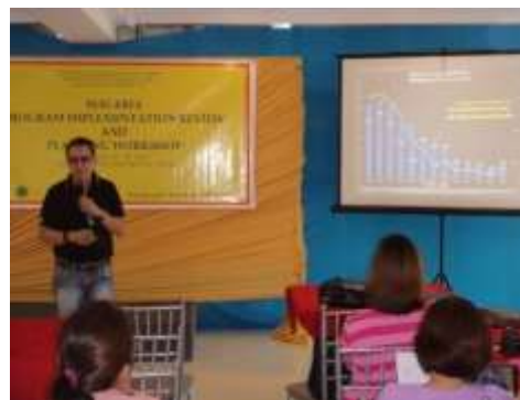
The Deputy Program Manager for Field Operations of Pilipinas Shell discusses the 2015 National Malaria