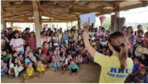
Information, education, and communication campaign for the disease malaria during the celebration of World Malaria Day 2016 at Brgy. Dibuluan, San Mariano