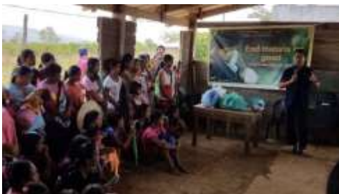
Celebration of 2016 World Malaria Day at Brgy. Dibuluan, San Mariano last April 14, 2016 with the theme: “End malaria for Good”; opening message by the PHO Provincial Malaria Coordinator

Long Lasting Insecticide-treated Net distribution in different municipalities: