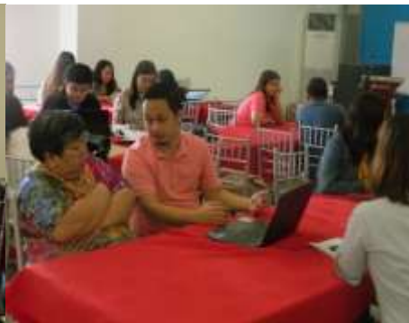
The Project Officer of Pilipinas Shell Foundation Inc. reports the status and accomplishments in the implementation of the Malaria Control Program for the province of Isabela.