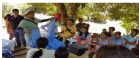
Integrated field visit of Rural Health Unit Cabagan with Long Lasting