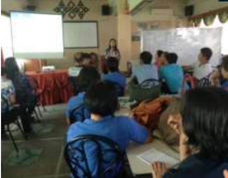
The Provincial DOH-RO2 team shares their expertise in their assigned topics