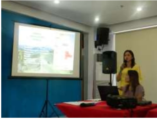
Presentation of status, accomplishments and strategies of the municipality of San Mariano in implementing the Malaria Control Program by the Municipal Health Officer of San Mariano