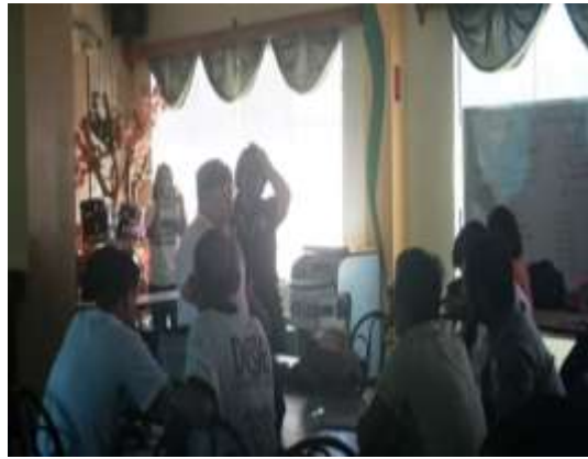
The Provincial Health Officer II delivers her inputs during the open forum