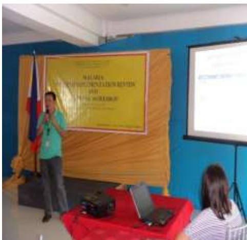
The Medical Coordinator of the Department of Health Regional Office 2 discusses the regional malaria status of Region 2 for the year 2015