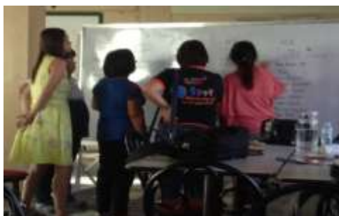
Creation of Provincial Technical Assistance LIPH Planning team per district