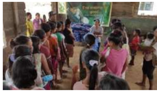
Malaria Point Person of San Mariano RHU discusses proper way of using Long Lasting Insecticide-treated Nets before distribution at the World Malaria Day celebration