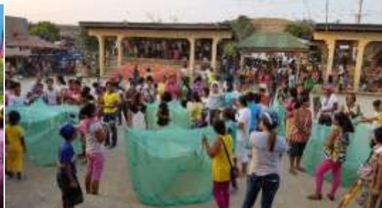
Celebration of World Malaria Day 2016 at Brgy. Disulap, San Mariano with community members participating in prepared games as information, education, and communication campaign;