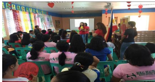
The Assistant AHYD coordinator during the Q&A portion where prizes are given to the participants