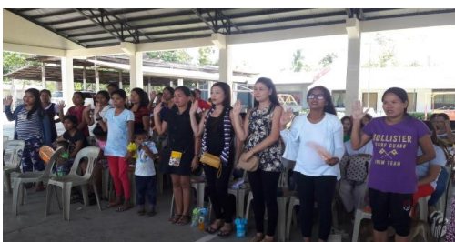
Pledge of Commitment for Safe Pregnancy and Delivery among the pregnant women