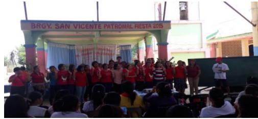
The Barangay Officials and Health Workers oath to protect the welfare of pregnant women