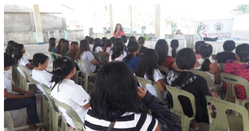
The participants actively listen to the lectures from the Provincial MCH coordinator regarding rationale and objectives among the participants