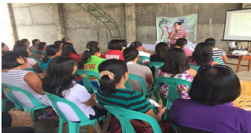
The Municipal Mayor of Gamu gives his opening message to everyone