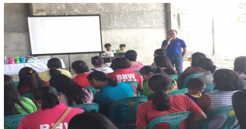
The Health Education & Promotion Officer (HEPO) discusses the rationale and objectives of the activity among the participants