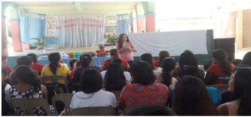
The MCH Coordinator discusses the Maternal Health in Pregnancy