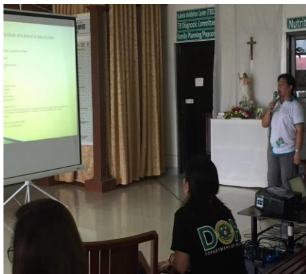
Plenary presentation of accomplishments by different program managers