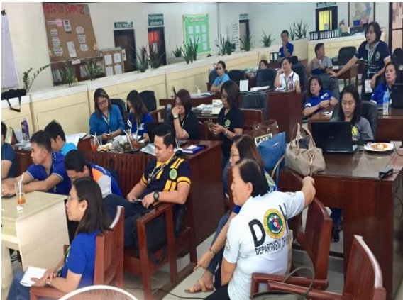
Review by the Provincial DOH Officers