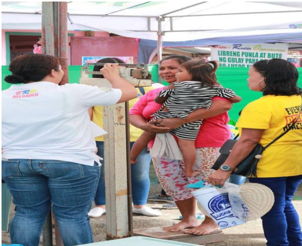
Weighing of identified malnourished child in San Isidro.