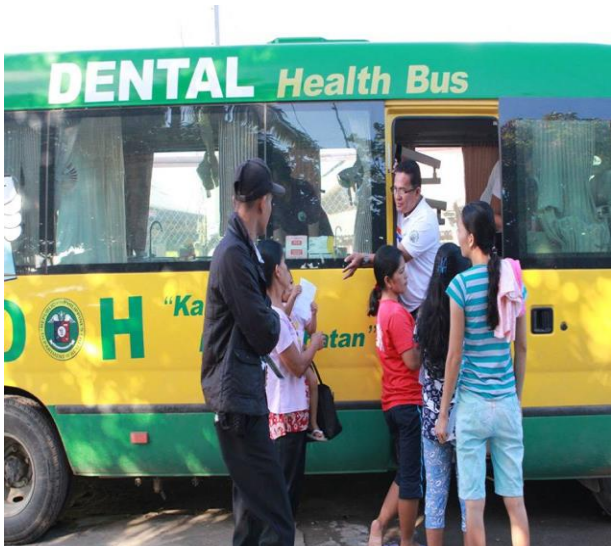
A Dental Aide ushers in patients for tooth extraction utilizing the Dental Health Bus.