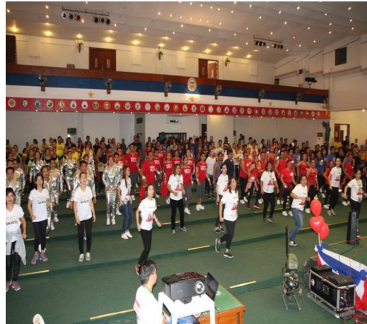
As a preliminary activity, a warm-up exercise set the mood during the entire day