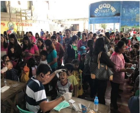
Cordon Feb 8- Flouride application to day care pupils