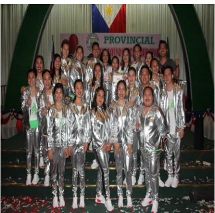
The Lucky three, who are set to compete during the Regional Level HATAW DANCE COMPETITION