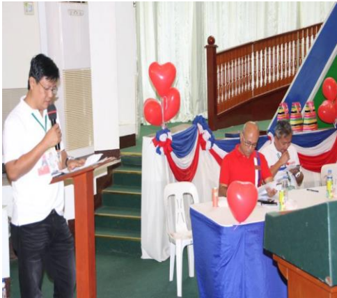
The Provincial Administrator, the SP on Health and the Provincial Health Officer II give their all-out support to the conduct of the HATAW activity