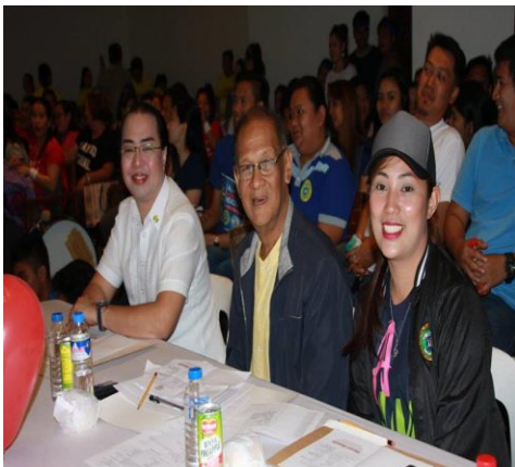
The board of judges excitedly smile at the camera during the HATAW launching.