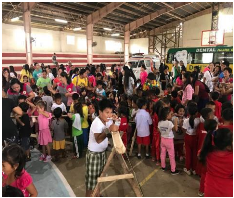
San Guillermo- Feb 15