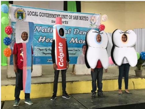
Feb 13 San Mateo- Health workers don their own mascots during the kick-off activity