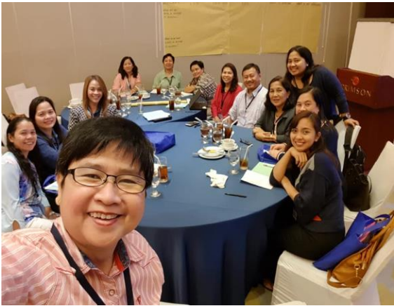
The Isabela team joined by other delegates from other provinces after the workshop.