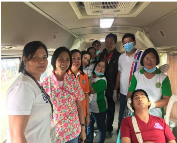
The PHO II poses with the provincial and municipal dentists as they provide dental services in Quirino, Isabela