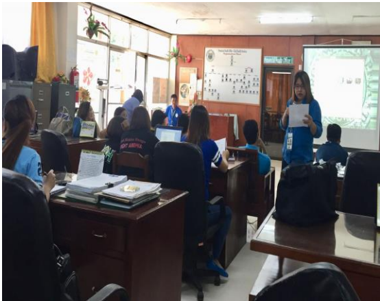
Order of presentation for the 2-day activity by the Administrative Officer