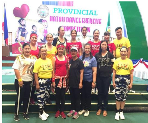
The Association of Municipal Health Officers (AMHOP) of Isabela pose as a show of support to the activity