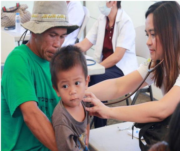
A sick child receives medical attention from a PHO Doctor in Gamu