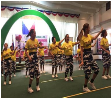
The different contenders show off their dancing prowess during the actual HATAW competition