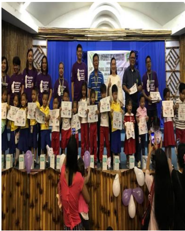
Taken in Cauayan City wherein the Provincial Dentist speaks about the National Dental Health Month activities during their flag-raising ceremony