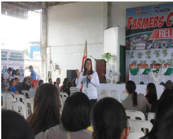
A Nutritionist from the PHO enlightens the constituents of Gamu about the benefits of the BRO-LUSOG