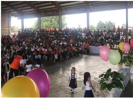
Quirino- Feb 14, 2018