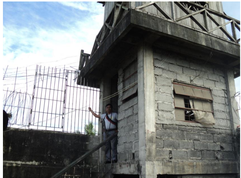
Fig. 8 Photograph Showing Tower 1 guard house of Isabela Provincial Jail.