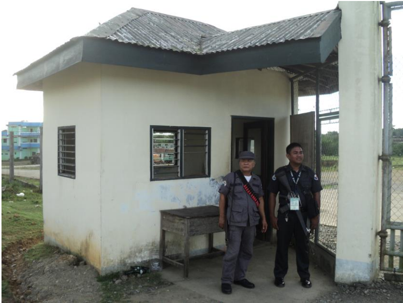
Fig. 7- Photograph showing the Gate Guard House of Isabela Provincial Jail.

The Isabela Provincial Jail is maintaining Three (3) Guard houses, and 16 capacity CCTV camera. These facilities serves the security measures being maintained by the Jail personnel.