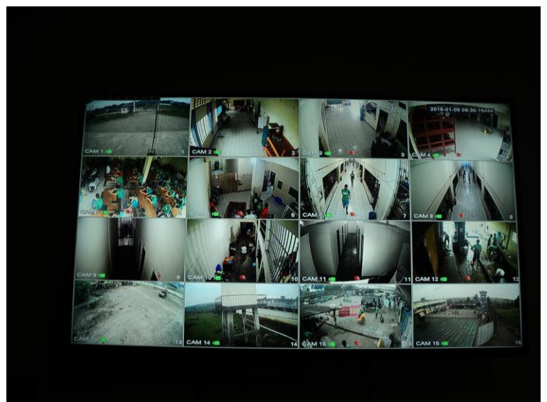
Fig.10. Photograph showing the 16 capacity CCTV of the Isabela Provincial Jail.