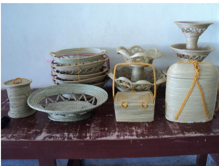
Fig. 4- Photograph showing finish Products of Cogon (basket, fruit tray and back pack.) Likewise the finish Products of plastic beads (shoulder bag and purse) and finish products of recycled 3 in 1 coffee wrappers (purse).

For the period, livelihood Program is undertaken by way of continuous involvement in handy craft Project like basket, fruit tray, purse, shoulder bags, key chains and others, using COGON, PLASTIC BEADS and recycled wrappers of 3 in 1 coffee, as their major materials and the finish products of which are displayed in public for sale. Other inmates/detainees were engaged in poultry, duck, goat and pig raising inside the perimeter fence of Isabela Provincial Jail.