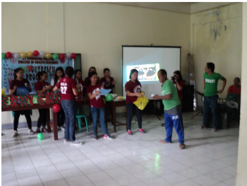
Fig. 20- Photograph showing the students of Saint Ferdinand College (College of Arts and Sciences) distributing gifts to inmates who belong to indigent families.