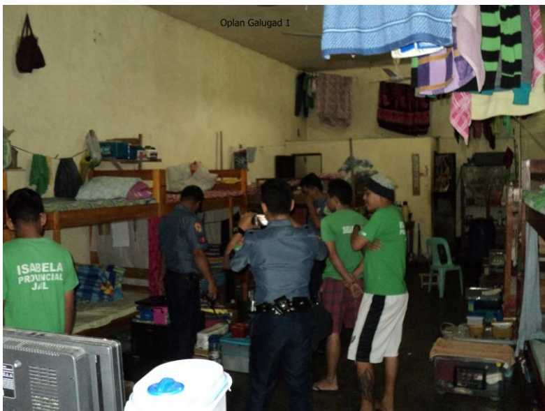
Fig. 12- Photograph showing the actual conduct of cell searched of PNP personnel in relation to their “Oplan Galugad” Program.