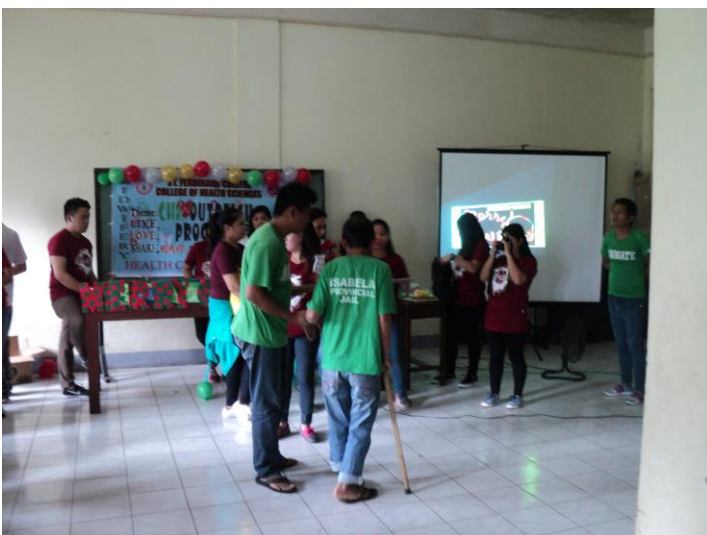
Fig. 21. Photograph showing students of Saint Ferdinand College conducting simple program with inmates before the actual gift giving.