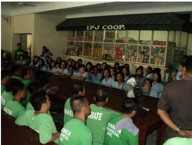
Fig. 17- Photograph showing the members of the Department of Agrarian Reform (DAR) Association.