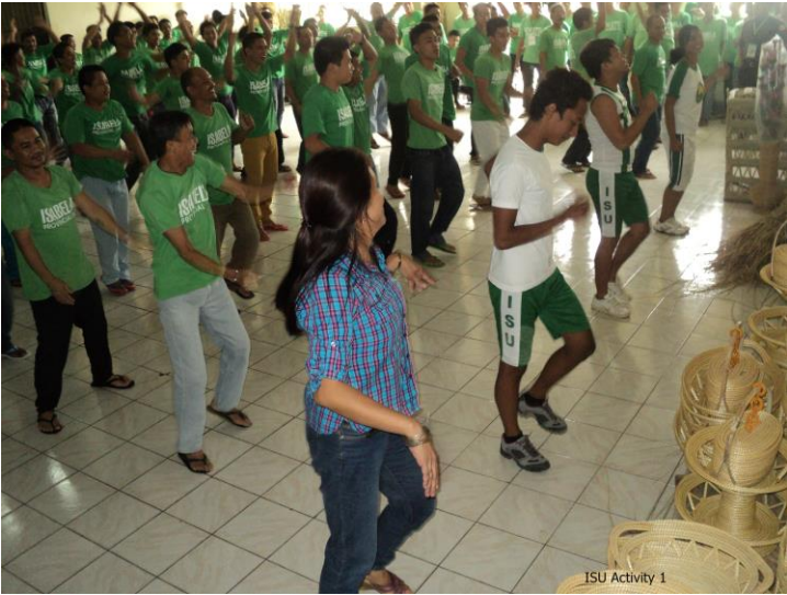
Fig. 6- Photograph showing students and personnel of Isabela State University of Cabagan, Isabela conducted Inmates Physical Fitness Program re: sports Activities from July 24, 2017 to August 21, 2017.