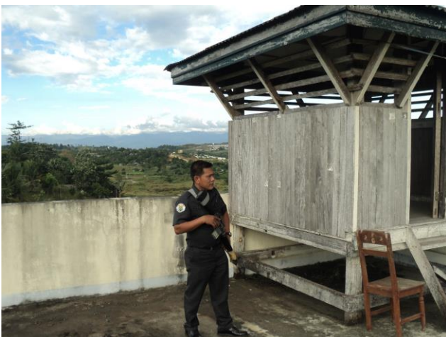
Fig. 9- Photograph showing the Tower 2- guard house of Isabela Provincial Jail.