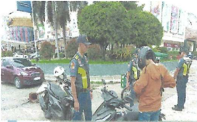
3VX4+84W Pan Philippine Hwy, Ilagan, Isabela, Philippines Ilagan Cagayan Valley Philippines 24°C 75°F 2024-01-02(Tue) 08:53(AM)