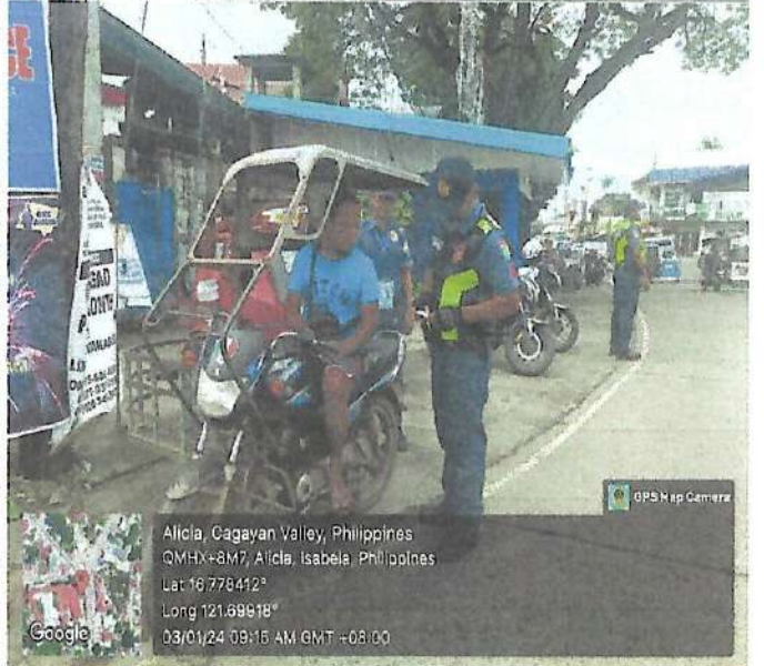
Alicia, Cagayan Valley, Philippines QMHX+8M7, Alicia, Isabela, Philippines Lat 16.778412° Long 121.69918° 03/01/24 09:15 AM GMT +08:00