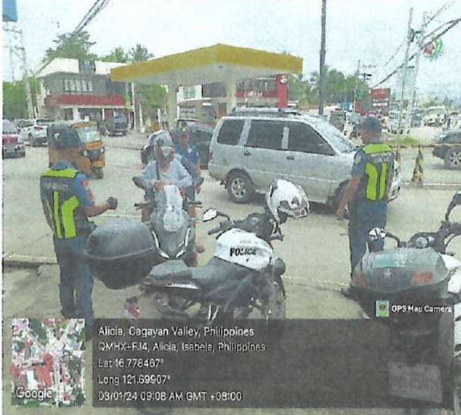
Alicia, Cagayan Valley, Philippines QMHX+FJ4, Alicia, Isabela, Philippines Lat 16.778467° Long 121.69907° 03/01/24 09:08 AM GMT +08:00