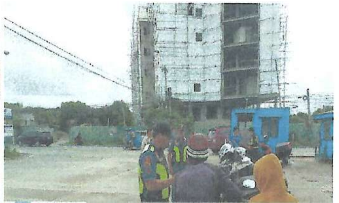
3VX4+66W Pan Philippine Hwy, Ilagan, Isabela, Philippines Ilagan Cagayan Valley Philippines 24°C 75°F 2024-01-02(Tue) 08:51(AM)