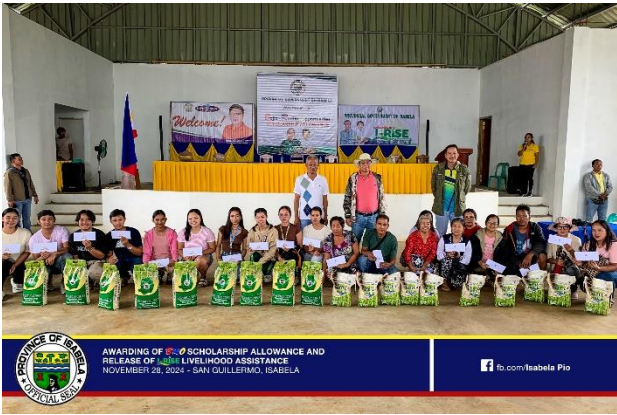
San Guillermo, Isabela