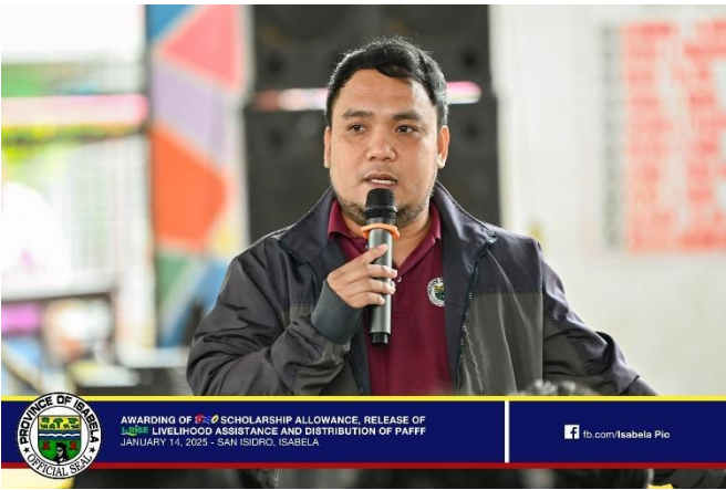
San Isidro, Isabela