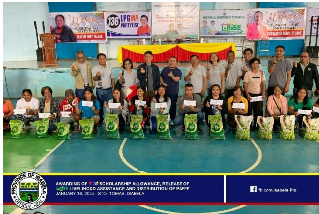
Santo Tomas, Isabela