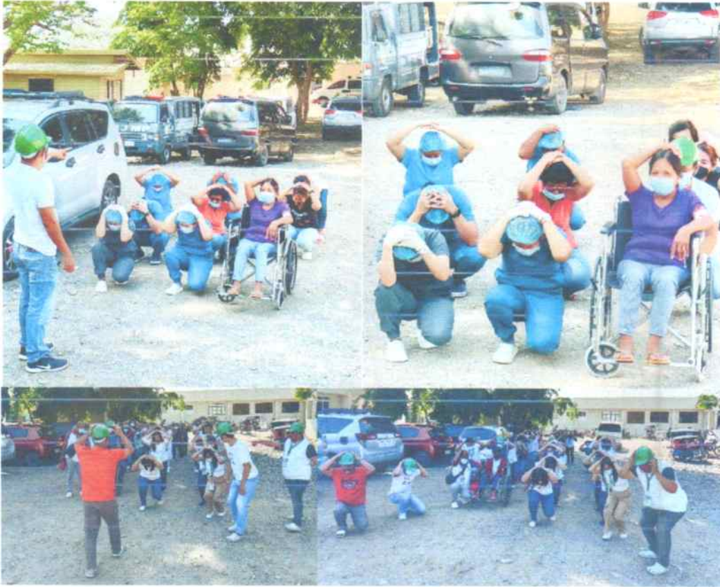
➤ On March 26 & 27, 2024, in-house Basic Life Support (BLS) Training at MADH