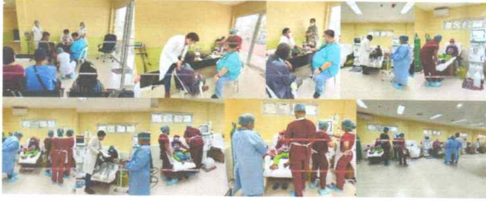
➤ On February 22, 2024, during the inspection of Dental and Xray Machines by DILG Representatives