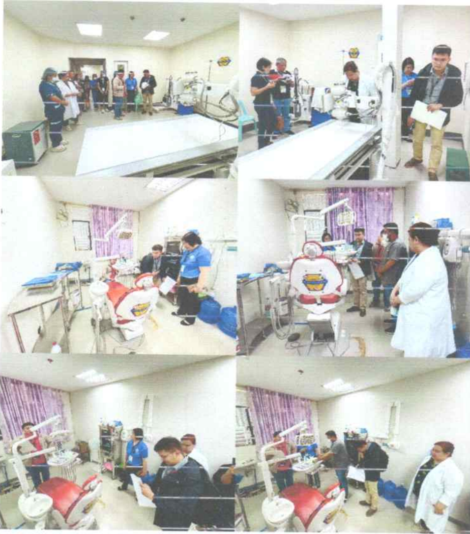
➤ On March 1, 2024, facility monitoring conducted by the DOH Region 02 Licensing Team