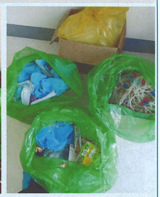
Milagros Albano District Hospital